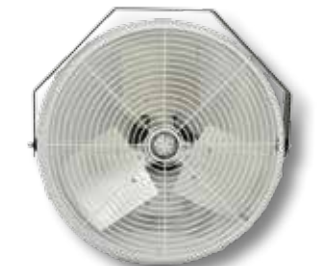
Corrosion Resistant Fans U-CR Series White grill & black yoke